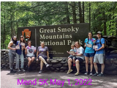
Mend 5K May 1, 2022