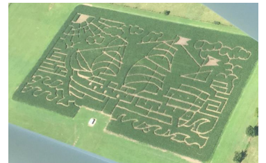
An aerial photo of the Hampton Corn Maze we visited. A visual reminder that while we feel lost in the maze of life, God sees the whole picture, and how beautiful it is.

While we are blind in our journey, there is One looking from above, seeing the whole picture of our journey, and how beautiful it is.